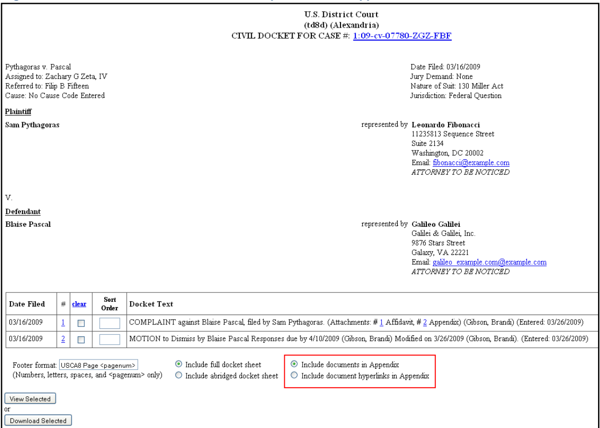
Figure A2.1.1. New Radio Buttons on Docket Report in Create Appendix Mode

When the Docket Report is run with the Create Appendix option selected, two new radio buttons are included at the bottom of the report: Include documents in Appendix and Include document hyperlinks in Appendix .